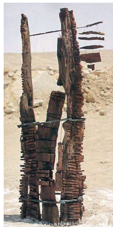
El Anatsui – Sculpture 1