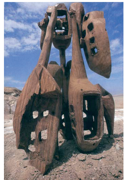
El Anatsui – Sculpture 2

A television film called „Ondambo“ was also produced and broadcast several times on Namibian television as well as in film festivals in Namibia and Zimbabwe as well as in various exhibitions in Munich and New York (Camera and editing: A. Honisch).